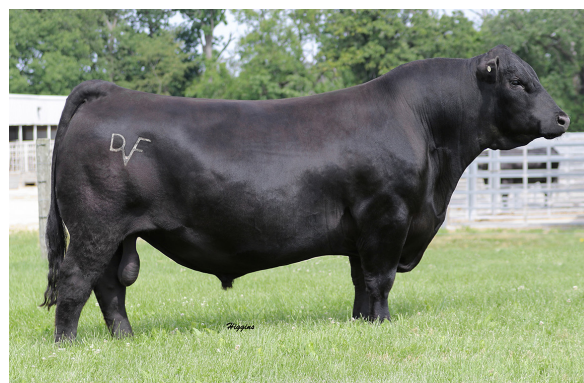
DEER VALLEY GROWTH FUND Sire of Lot 14, Grand sire of Lot 15

A favorite of our crew that is a grand son of Growth Fund. Top 3% of the breed for weaning and yearling.