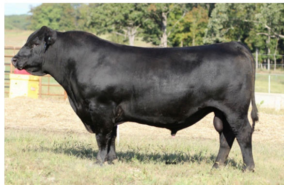
EXAR ENHANCE 8633B Sire of Lots 20 & 21

EXAR Enhance 8633B is one of our herd bulls. We love his calves. They are consistent in their kind and carry a balanced EPD profile. He is a Missouri Cattleman kind of bull and Lot 21 is a great representation why.