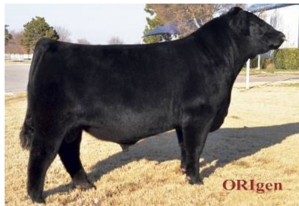
EXAR BLUE CHIP 1877B Sire of Lot 25

Calving ease sire with growth and performance. Top 10% of the breed for CED and BW EPD's and top 15% for yearling weight.