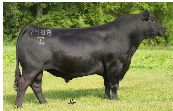
G A R HOME TOWN Sire of Lots 9 - 13

Another calving ease sire here that is balanced both phenotypically and on paper. $C in the top 10% of the breed and top 3% marbling. Its nice to find heifer bulls that will still add growth that can be followed all the way to the rail. Here he is.