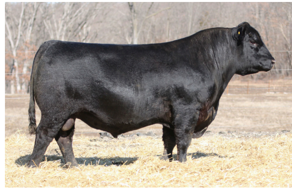
EXAR INSTRUMENTAL 8522B Sire of Lots 30, 38, 39, 41 & 44

Out of a clean up bull, but this cow has a tremendous look from the side with lots of rib shape. Lot 46 is due to calve on 11/1 to EXAR West Point 0618B.