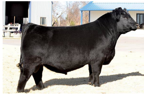
C & C INTUITION 7104 Sire of Lots 35 & 36

A female that we purchased from Valley Oaks in a past production sale of theirs as a young heifer. She is a nice made female with a load of look. Lot 37 calved on 9/14 to Tehma Testament with a heifer calf. Calf Registration AAA # 20743624