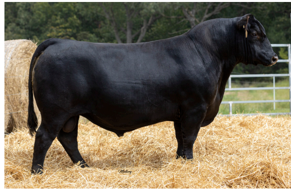
EXAR WEST POINT 0618B Service Sire

Consistency defines this female. Calving, performance, and breeding, this cow family is consistent. Lot 42 is due to calve on 10/12 to EXAR West Point 0618B.