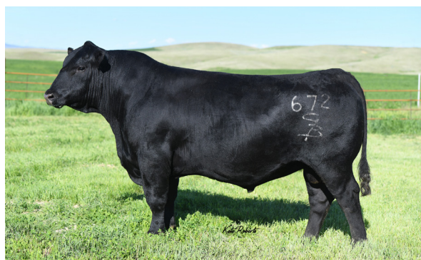
GB FIREBALL 672 Sire of Lots 1 & 2