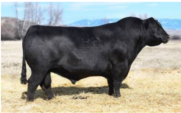
BASIN DEPOSIT 6249 Sire of Lot 3, Grandsire of Lots 4 & 5

Basin Deposit calves have been a favorite sire group here at Meyer Cattle when it comes to true power and growth. This is a good beef bull that sure did his job from the moment he hit the ground. He weighed right up at weaning with 880 pounds and a 1360 yearling weight. No matter when you sell your calves, this bull will sure make your checkbook happy.