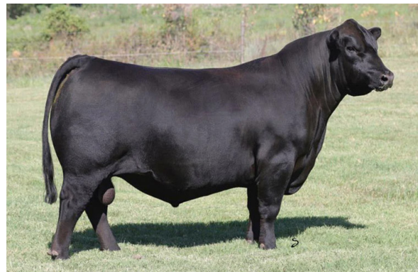
STEVENSON TURNING POINT Sire of Lot 43

First calf beifer from one of Lexi's cows purchased from Ward Brothers. This female is long bodied with some look and muscle. You will like this pair. Lot 43 calved on 9/14 to Tebma Testament with a bull calf. Calf Registration AAA # 20745251